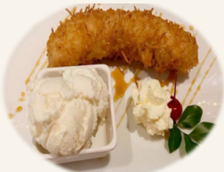
Banana fritter served with ice cream $9