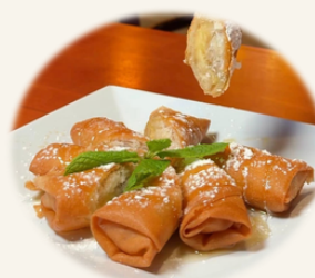
Banana rolls served with ice cream $9