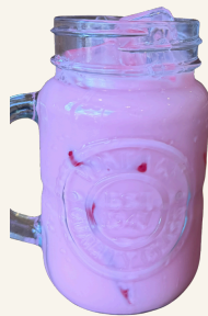
Thai Pink Milk $6