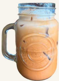
Thai Milk Tea $6