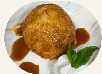
Deep-fried ice cream $9