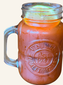
Thai Tea with Lime $6